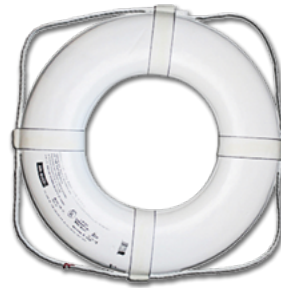
362034 24" Coast Guard Approved Life Ring ▶ Vinyl coated foam ring ▶ Attached rope for grasping ▶ UL listed