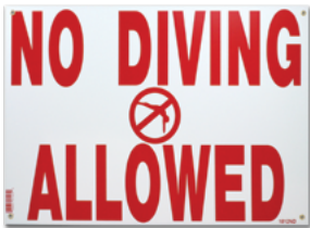
422020 No Diving Sign ▶ 12" x 18"