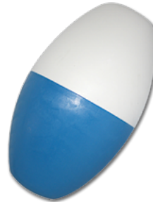
362039 Plastic Pool Rope Float ▶ Blue & White plastic rope float ▶ 3/4" Hole ▶ 5" x 9"