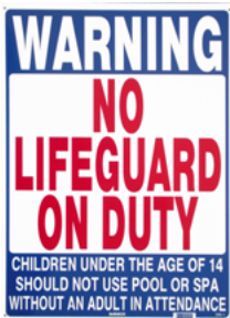
422021 Warning No Lifeguard On Duty Sign ▶ 18" x 24" ▶ Plastic ▶ [Warning text is 4" to comply with DHS 172.23]