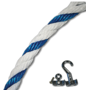
Pool Rope ▶ Polypropylene ▶ Blue/White high visibility ▶ Sold by the foot

362037 1/2" 362038 3/4" 362027 1/2" Pool Rope Hook 362028 3/4" Pool Rope Hook