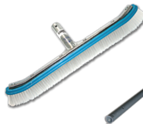
362064 18" Floor & Wall Pool Brush ▶ 18" Wide ▶ 1-1/4" nylon bristles ▶ Attaches to standard pool pole

362037 1/2" 362038 3/4" 362027 1/2" Pool Rope Hook 362028 3/4" Pool Rope Hook