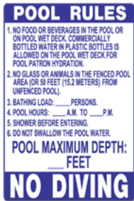
Pool Rules Sign ▶ 24" x 36"