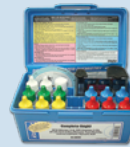
Taylor Test Kit 362014