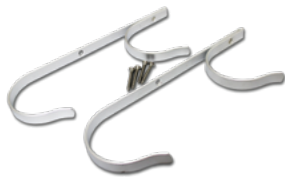
362049 Aluminum Pole & Hose Hanger Set ▶ Hangers for pool hoses and poles ▶ Aluminum ▶ Includes mounting screws ▶ 13" X 12" X 9" ▶ Sold in pairs