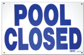
422019 Swimming Pool Closed Sign ▶ 12" X 18"