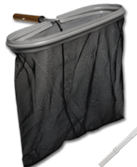
362046 Pool Leaf Rake ▶ Fiberglass net ▶ Clips onto 1-1/4" pole ▶ Solid tubular frame ▶ 18" long x 7" wide opening

Don't Forget! 362051 12' Straight Pool Pole